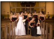
Img No: -027 (2) - 5x7 Portrait