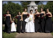
Img No: -012 (2) - 5x7 Portrait