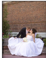
Img No: -021 (1) - 8x10 Portrait