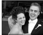
Img No: -007 (1) - 16x20 Portrait