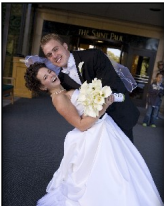
Img No: -010 (2) - 4x5 Portrait