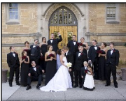
Img No: -016 (1) - 8x10 Portrait